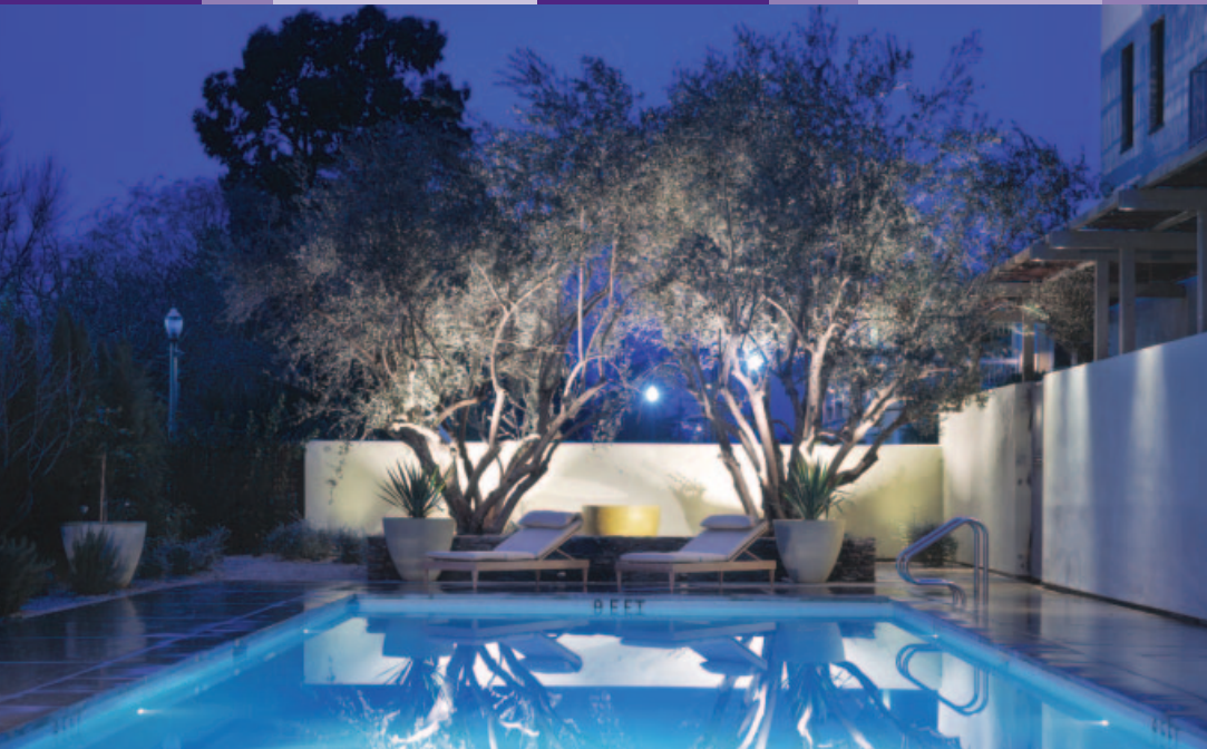
Hotel Healdsburg pool