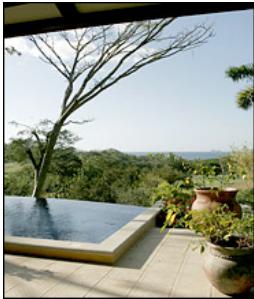
The view from a villa at Reserva Conchal

Guanacaste, is at the center of the transformation. Three years ago, when the first direct flights from the United States landed, only 50,000 people a year arrived there. In 2005, 300,000 did.